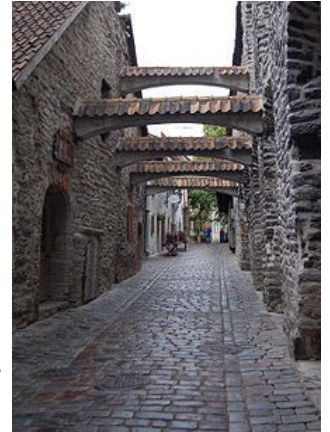
St. Catherine's passage in Tallinn