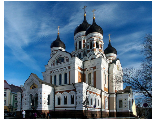
Alexander Nevsky Cathedral, Tallinn, built in 1894–1900.