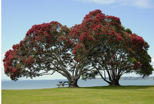
Pōhutukawa trees of New Zealand

exchange's dates are Sept 10—Sept 29, 2010, with hosts in Canberra and the Gold Coast, stays in Sydney and an additional land